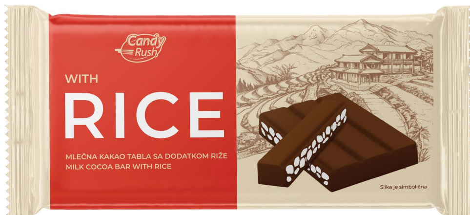
CANDY RUSH RICE 130g