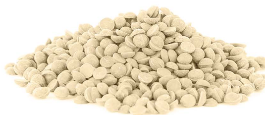
CANDY RUSH DESSERTINA WHITE DROPS 5kg