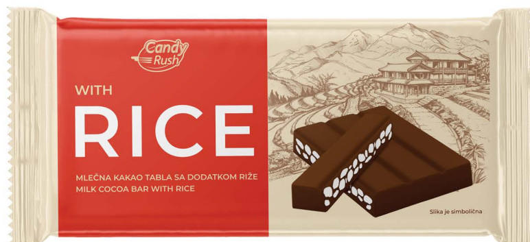
CANDY RUSH RICE 70g