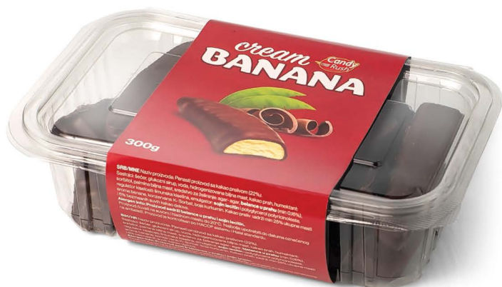
CANDY RUSH DARK BANANA 240g