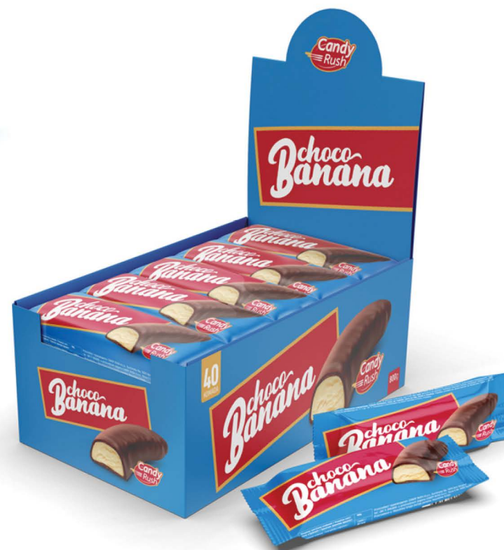
CANDY RUSH CHOKO BANANA PLAVA 20g