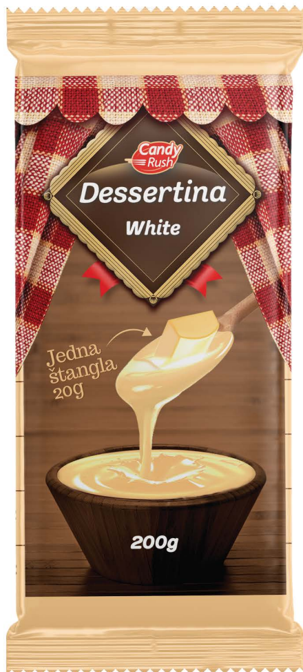
DESSERTINA WHITE 200g