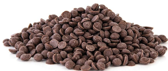
CANDY RUSH DESSERTINA DARK DROPS 5kg