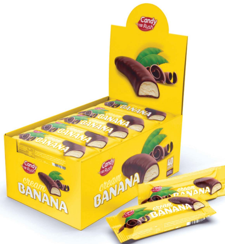
CANDY RUSH KREM BANANA ŽUTA 20g