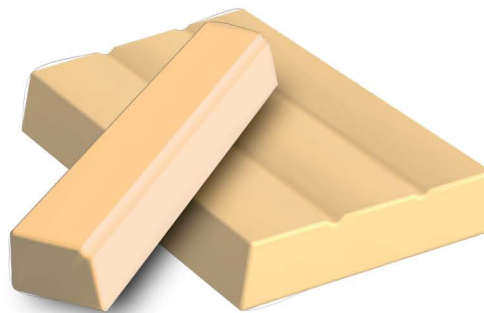
CANDY RUSH DESSERTINA WHITE RINFUZ 4kg