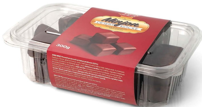
CANDY RUSH MINJON KOCKE 300g