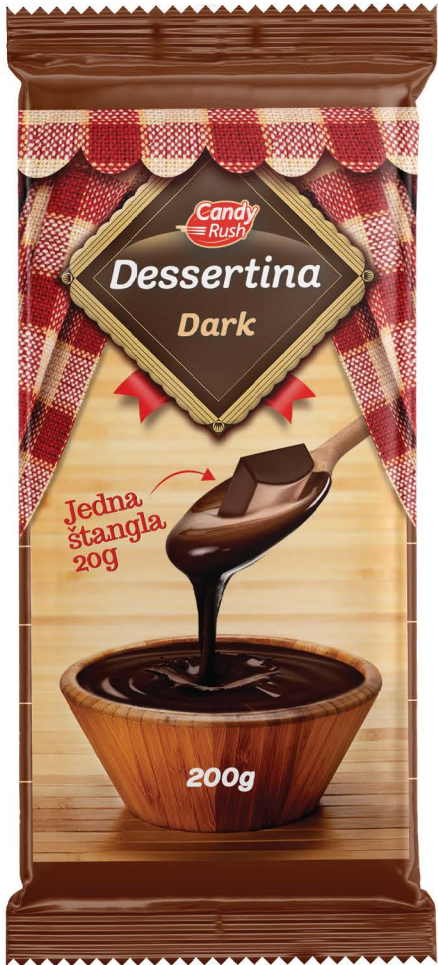
DESSERTINA DARK 200g