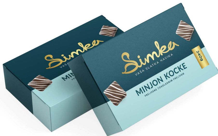
SIMKA MINJON CUBES Box 240g