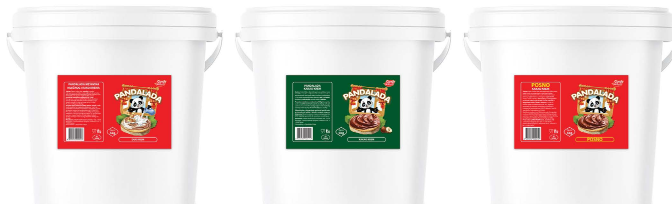
CANDY RUSH PANDALADA DUO 5/10kg