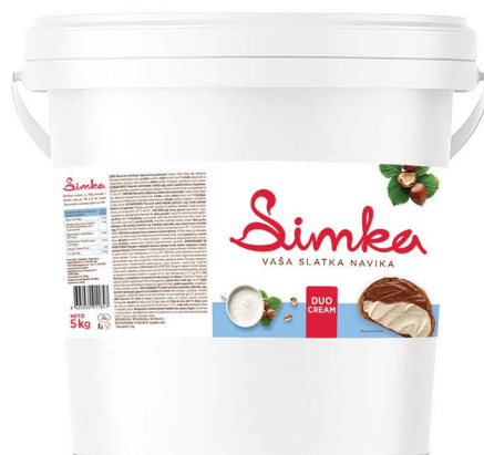
SIMKA DUO HAZELNUT 5Kg/10Kg