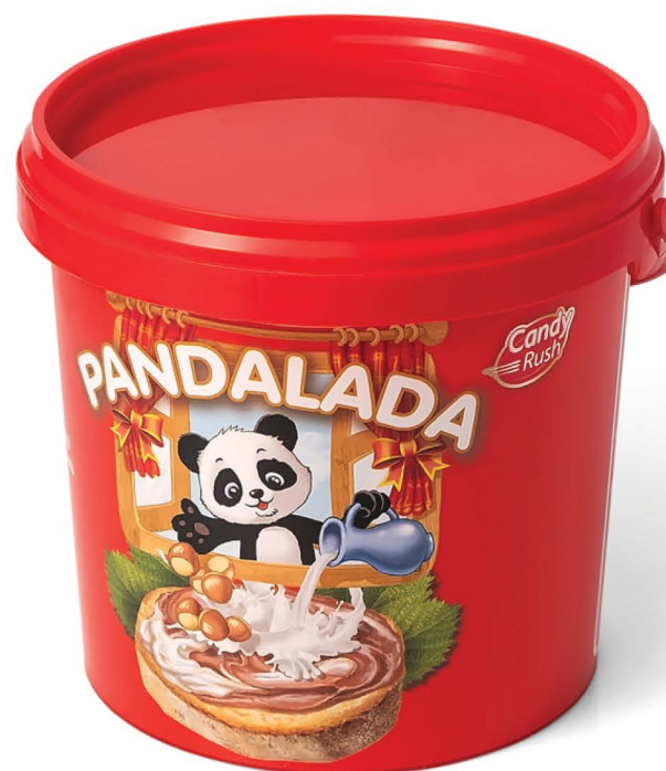
CANDY RUSH PANDALADA DUO 800g