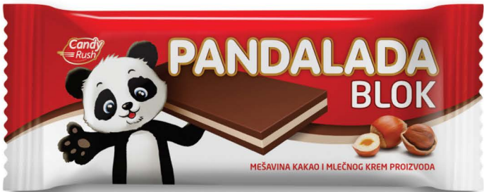
CANDY RUSH PANDALADA BLOK 80g