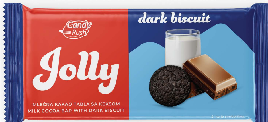
CANDY RUSH DARK BISCUIT MILK COCOA BAR 100g

Savor the indulgence of our milk cocoa bar with dark biscuit. This delightful treat combines the smoothness of creamy milk chocolate with the rich, robust flavor of dark biscuit pieces. Each bite offers a perfect harmony of sweetness and crunch, making it an exquisite snack for any chocolate lover. Enjoy it on its own or as a delicious addition to your favorite desserts!