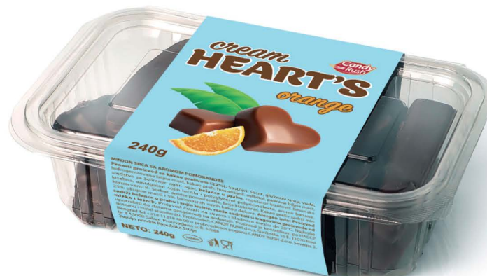
CANDY RUSH HEART S 240g