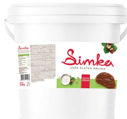
SIMKA COCOA HAZELNUT 5Kg/10Kg