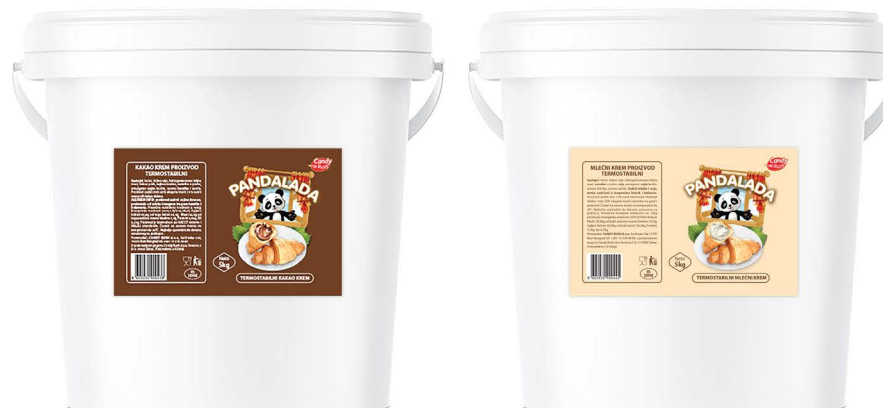
CANDY RUSH PANDALADA TERMOSTABIL SREAD DARK 5/10kg