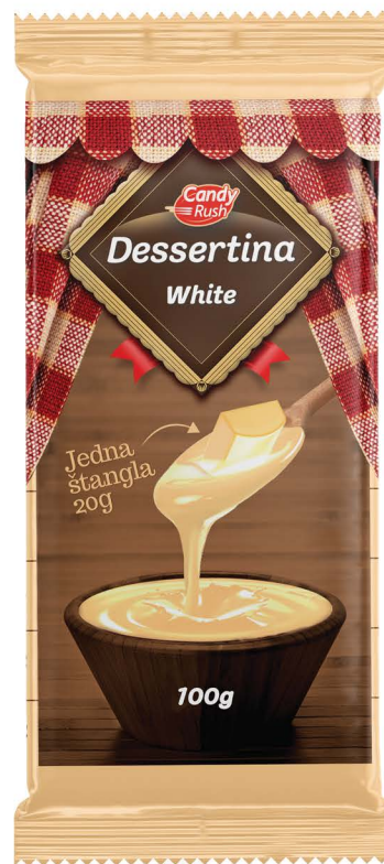
DESSERTINA WHITE 100g