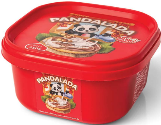
CANDY RUSH PANDALADA DUO 250g