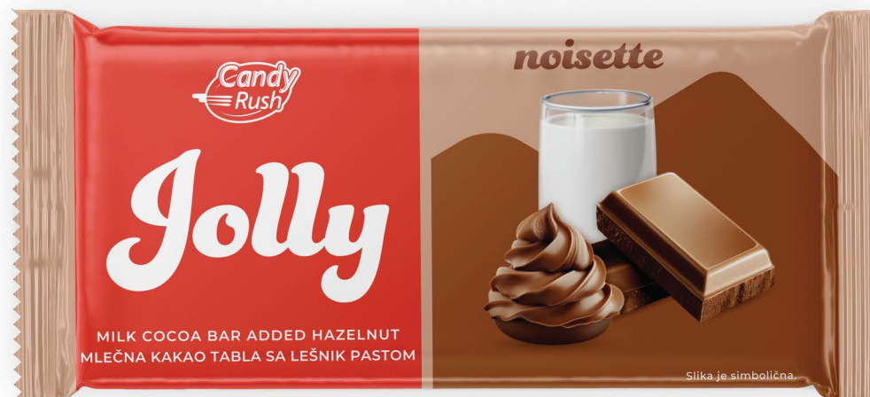
CANDY RUSH NOISETTE MILK COCOA BAR 100g

Milk cocoa bar with added noisette offers a delightful combination of rich, creamy chocolate and the subtle crunch of hazelnut. This unique blend delivers an unforgettable taste experience that satisfies every sweet craving.