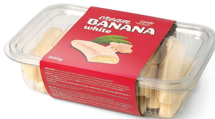
CANDY RUSH WHITE BANANA 240g