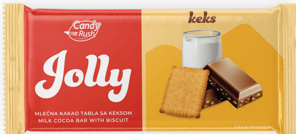
CANDY RUSH BISCUIT MILK COCOA BAR 100g

Indulge in our milk cocoa bar with hazelnut, which combines the smoothness of milk chocolate with the distinct flavor of hazelnuts . Each bite brings a perfect balance of creaminess and nutty richness, making it an irresistible treat.