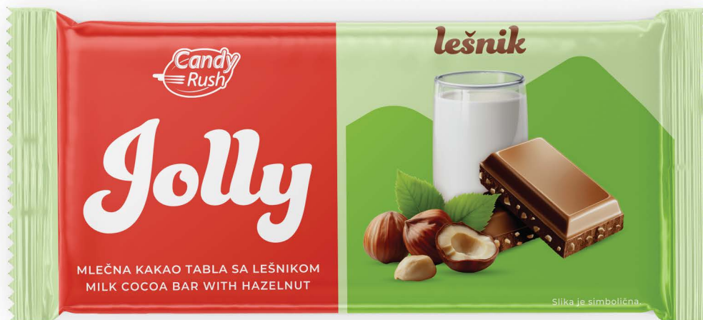
CANDY RUSH HAZELNUT MILK COCOA BAR 100g