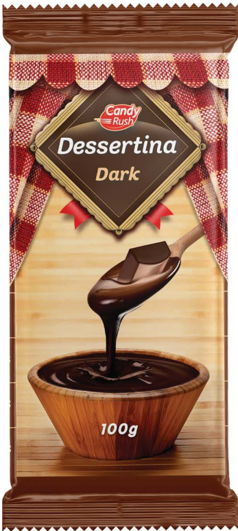
DESSERTINA DARK 100g