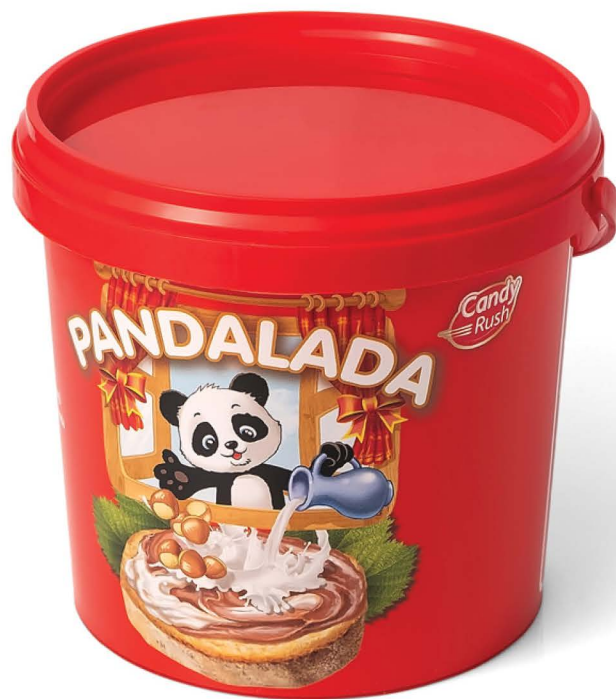
CANDY RUSH PANDALADA VEGAN 800g