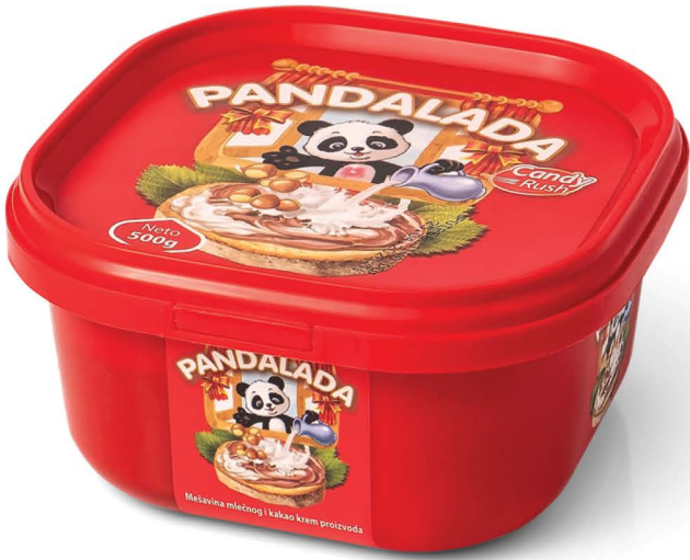
CANDY RUSH PANDALADA VEGAN 5000g

Vegan Pandalada cream is the perfect option for those seeking a delicious and creamy treat without any animal-derived ingredients. The combination of rich cocoa and carefully selected plant-based ingredients makes this cream ideal for any occasion.