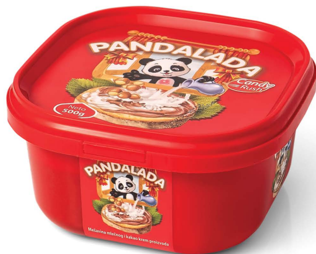
CANDY RUSH PANDALADA DUO 5000g