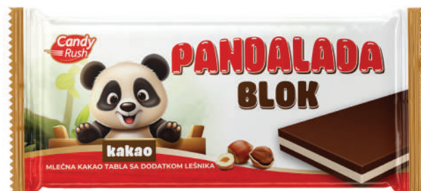
CANDY RUSH PANDALADA BLOK 80g

Blok Pandalada is a premium creamy dessert that combines the richness of cocoa and dairy products into a unique and delicious treat. It is ideal for a quick snack, as an ingredient in various desserts, or simply to enjoy with every bite.