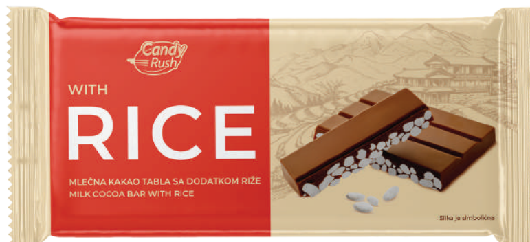
CANDY RUSH RICE 70g