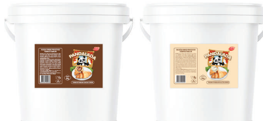
CANDY RUSH PANDALADA TERMOSTABIL SREAD DARK 5/10kg