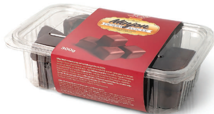
CANDY RUSH MINJON KOCKE 300g