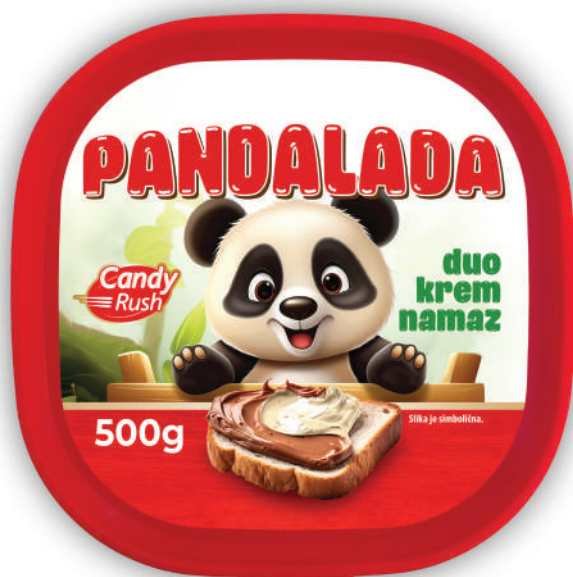
CANDY RUSH PANDALADA DUO 500g

Pandalada cream is the perfect blend of cocoa and dairy products, crafted to deliver a rich and creamy flavor that captivates with the first bite. It is ideal for spreading, baking, or as an addition to various sweet recipes. Tailored to meet all needs, it comes in both individual servings and larger family-sized packages.