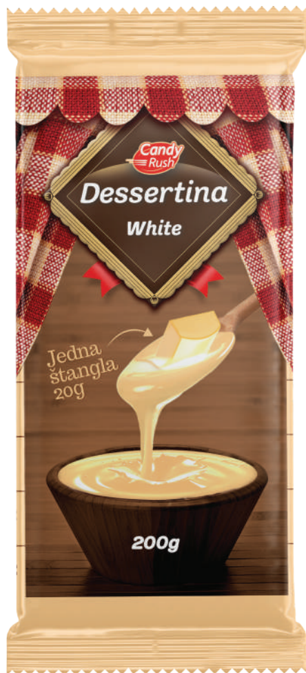
DESSERTINA WHITE 200g