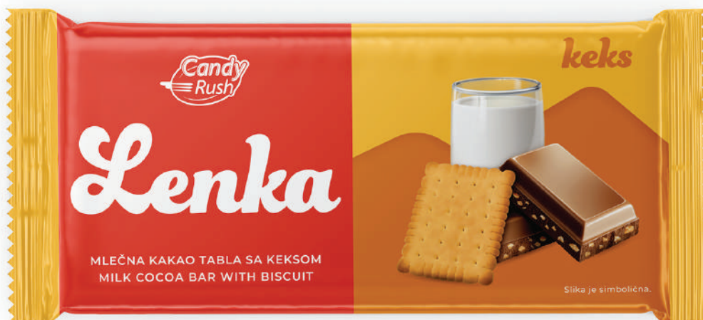
CANDY RUSH BISCUIT MILK COCOA BAR 100g