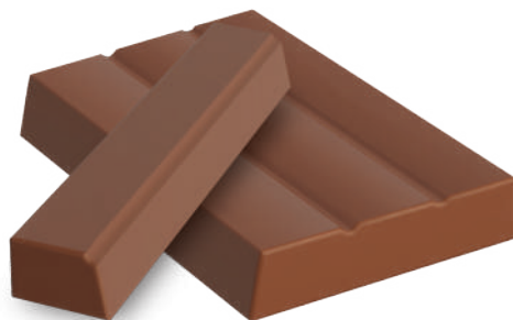
CANDY RUSH DESSERTINA DARK RINFUZ 4kg