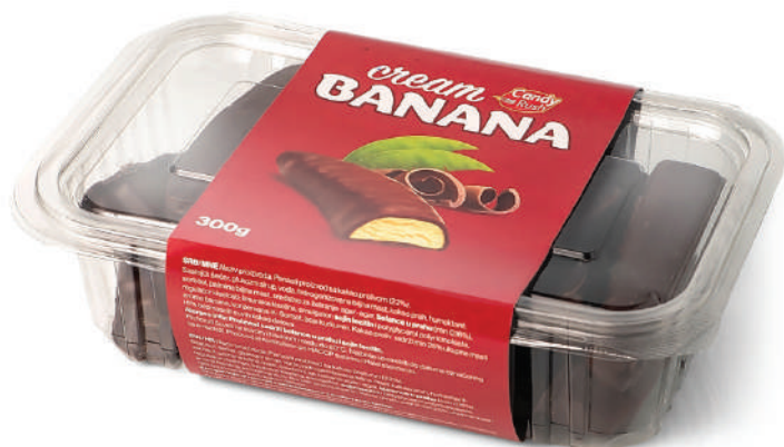
CANDY RUSH DARK BANANA 240g