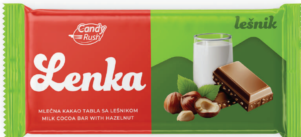
CANDY RUSH HAZELNUT MILK COCOA BAR 100g