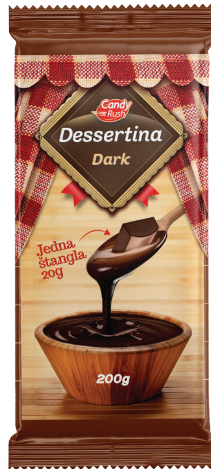
DESSERTINA DARK 200g