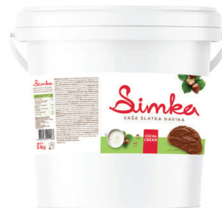
SIMKA COCOA HAZELNUT 5Kg/10Kg