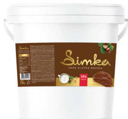
SIMKA 13% HAZELNUT 1Kg/5Kg/10Kg