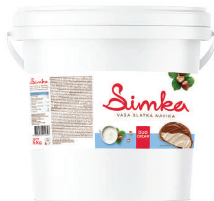
SIMKA DUO HAZELNUT 5Kg/10Kg