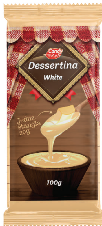
DESSERTINA WHITE 100g