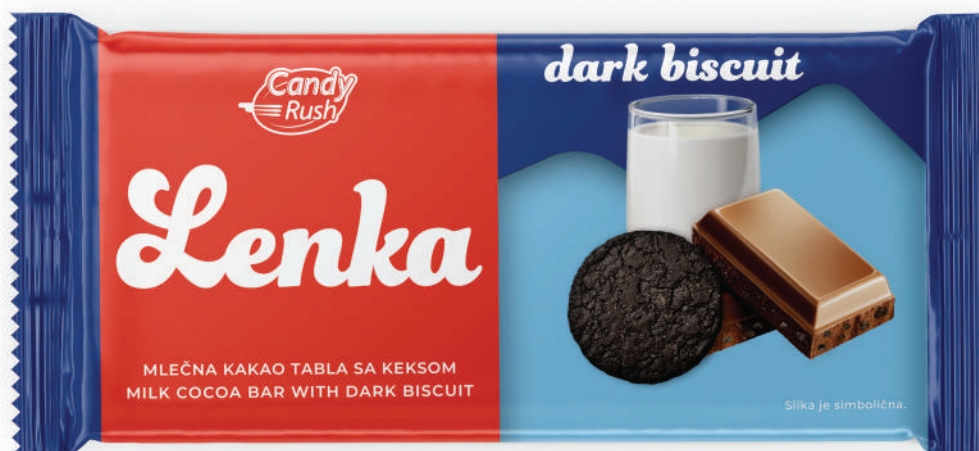
CANDY RUSH DARK BISCUIT MILK COCOA BAR 100g

Savor the indulgence of our milk cocoa bar with dark biscuit. This delightful treat combines the smoothness of creamy milk chocolate with the rich, robust flavor of dark biscuit pieces. Each bite offers a perfect harmony of sweetness and crunch, making it an exquisite snack for any chocolate lover. Enjoy it on its own or as a delicious addition to your favorite desserts!