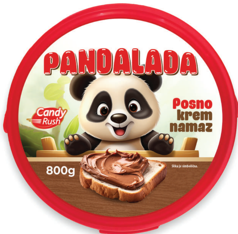
CANDY RUSH PANDALADA VEGAN 800g