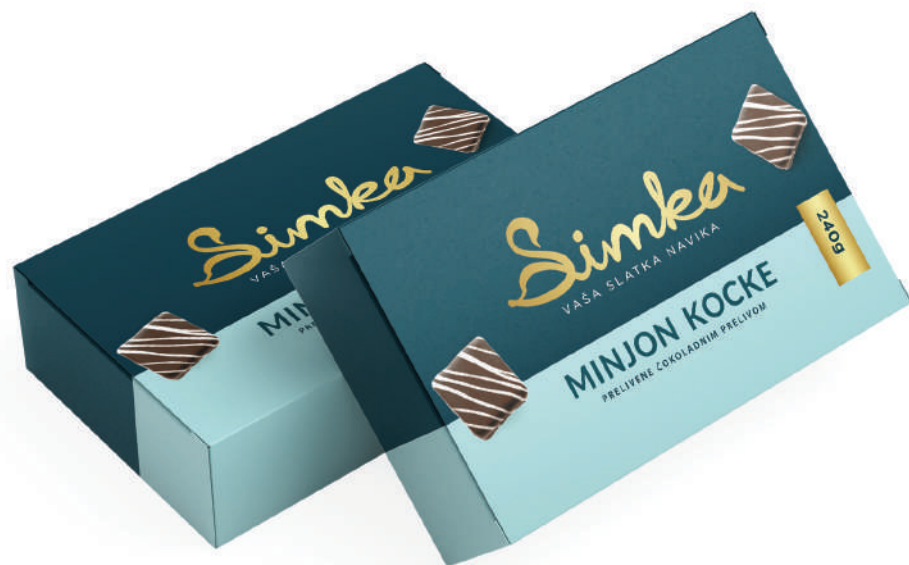
SIMKA MINJON CUBES Box 240g