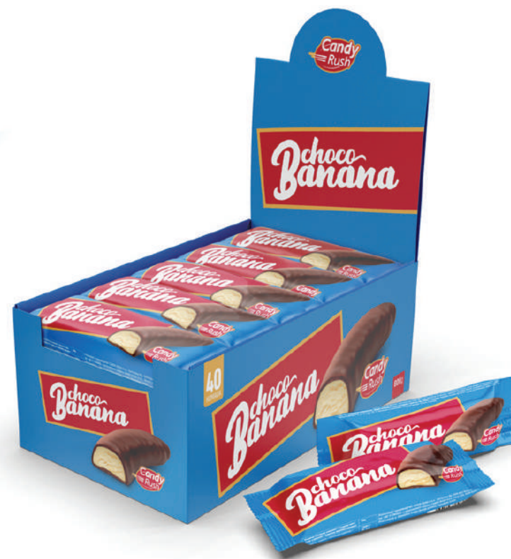
CANDY RUSH CHOKO BANANA 20g