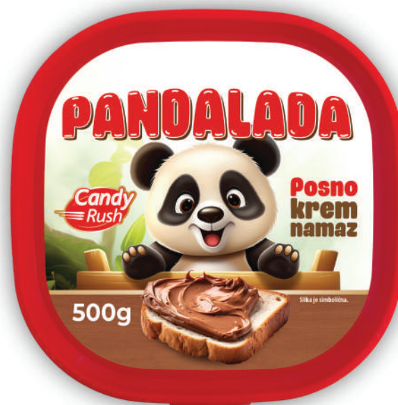
CANDY RUSH PANDALADA VEGAN 500g

Vegan Pandalada cream is the perfect option for those seeking a delicious and creamy treat without any animal-derived ingredients. The combination of rich cocoa and carefully selected plant-based ingredients makes this cream ideal for any occasion.