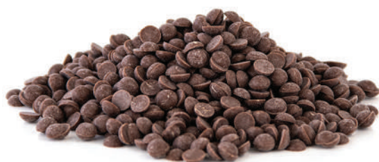
CANDY RUSH DESSERTINA DARK DROPS 5kg