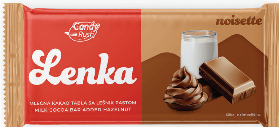
CANDY RUSH NOISETTE MILK COCOA BAR 100g

Milk cocoa bar with added noisette offers a delightful combination of rich, creamy chocolate and the subtle crunch of hazelnut. This unique blend delivers an unforgettable taste experience that satisfies every sweet craving.