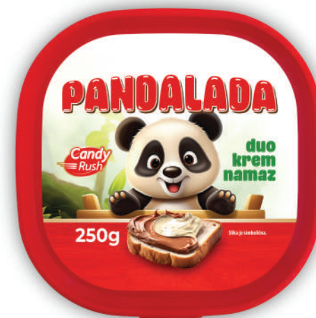
CANDY RUSH PANDALADA DUO 250g