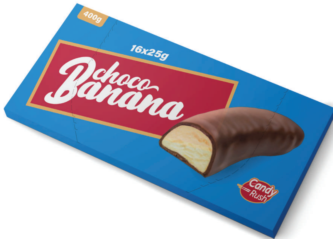
CANDY RUSH CHOKO BANANA 400g (16x25g)