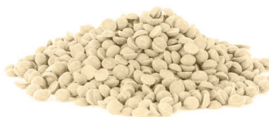
CANDY RUSH DESSERTINA WHITE DROPS 5kg