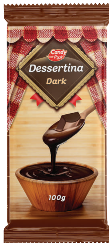
DESSERTINA DARK 100g