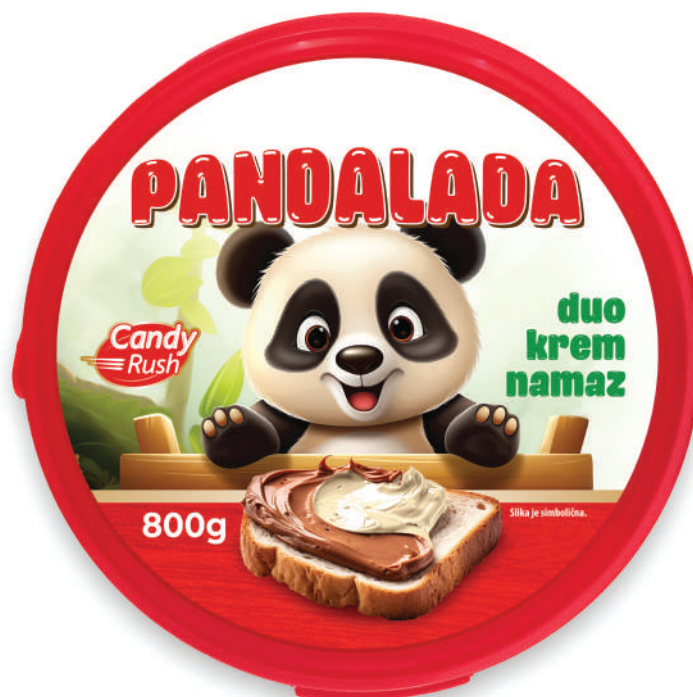
CANDY RUSH PANDALADA DUO 800g