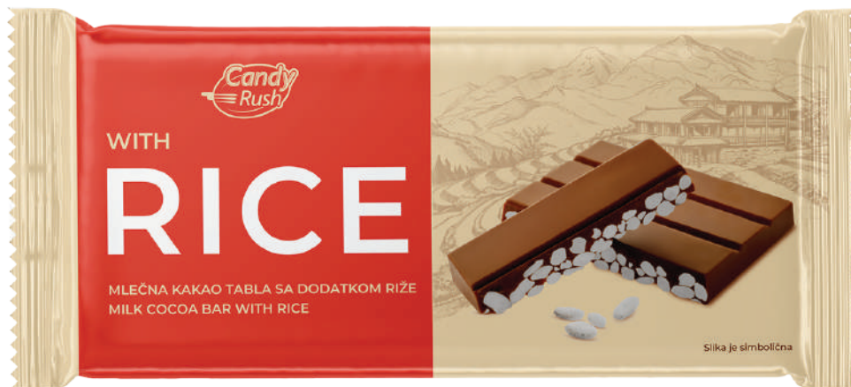
CANDY RUSH RICE 130g