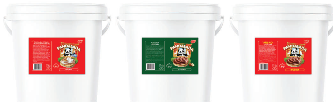
CANDY RUSH PANDALADA DUO 5/10kg