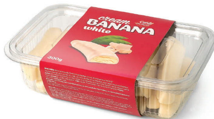
CANDY RUSH WHITE BANANA 240g