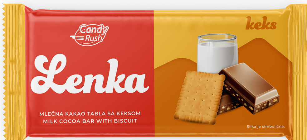
CANDY RUSH BISCUIT MILK COCOA BAR 100g