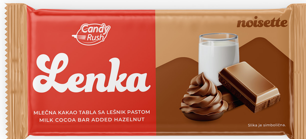
CANDY RUSH NOISETTE MILK COCOA BAR 100g

Milk cocoa bar with added noisette offers a delightful combination of rich, creamy chocolate and the subtle crunch of hazelnut. This unique blend delivers an unforgettable taste experience that satisfies every sweet craving.