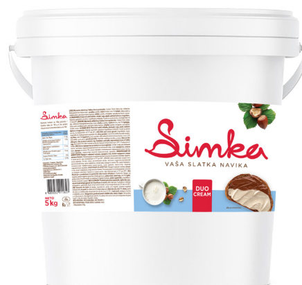
SIMKA DUO HAZELNUT 5Kg/10Kg