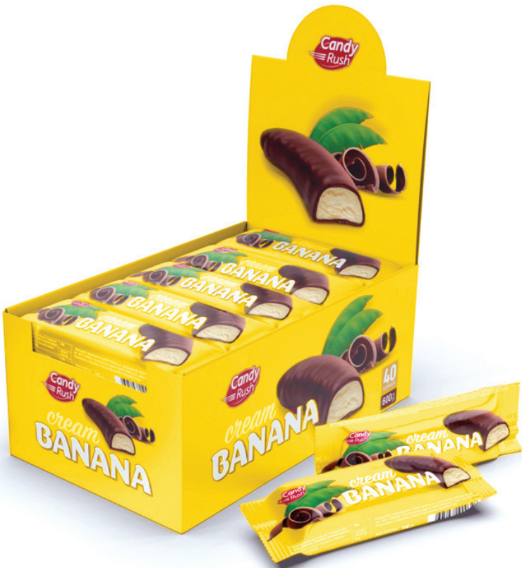
CANDY RUSH CREAM BANANA 20g