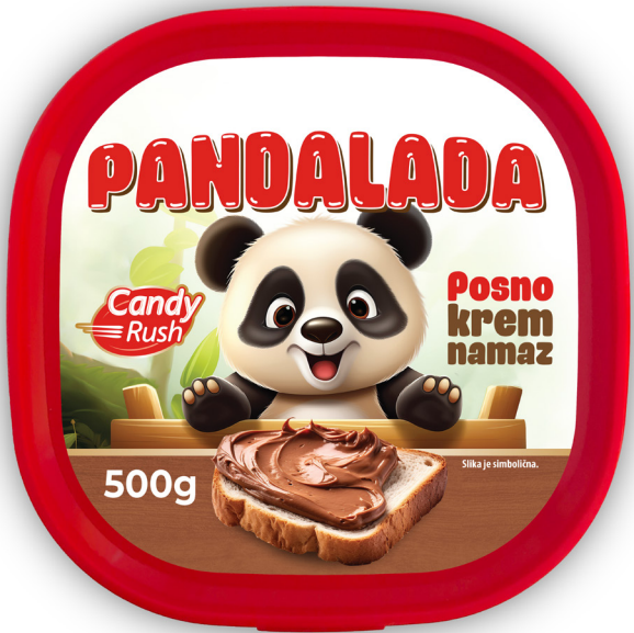
CANDY RUSH PANDALADA VEGAN 500g

Vegan Pandalada cream is the perfect option for those seeking a delicious and creamy treat without any animal-derived ingredients. The combination of rich cocoa and carefully selected plant-based ingredients makes this cream ideal for any occasion.