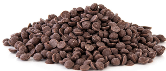
CANDY RUSH DESSERTINA DARK DROPS 5kg