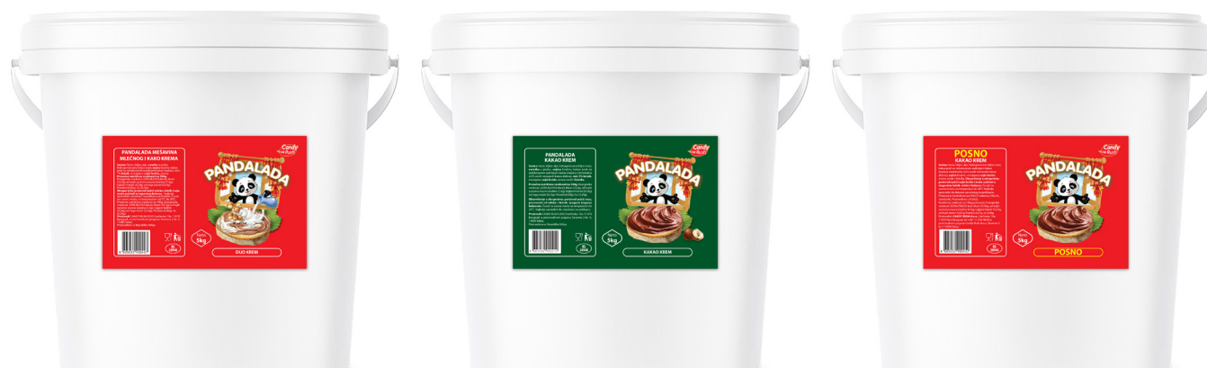
CANDY RUSH PANDALADA DUO 5/10kg