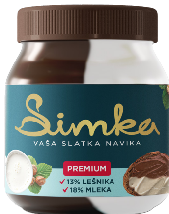
DUO PREMIUM 13% HAZELNUT 18% MILK