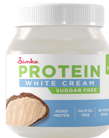
PROTEIN WHITE CREAM SUGAR FREE