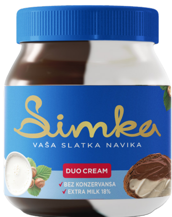
DUO CREAM EXTRA MILK