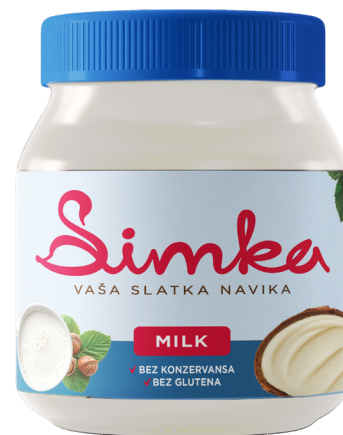
MILK CREAM 18% MILK