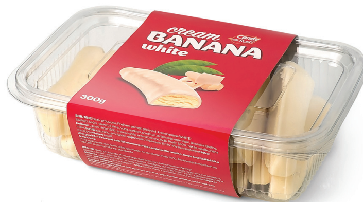
CANDY RUSH WHITE BANANA 240g