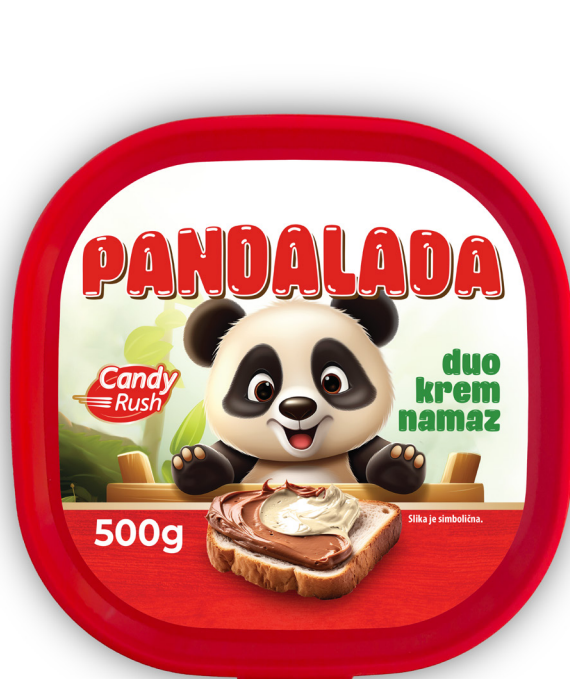
CANDY RUSH PANDALADA DUO 500g