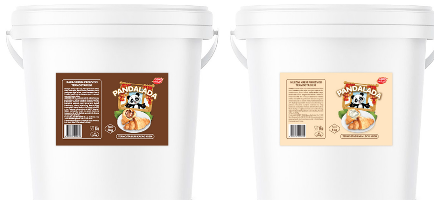
CANDY RUSH PANDALADA TERMOSTABIL SREAD DARK 5/10kg