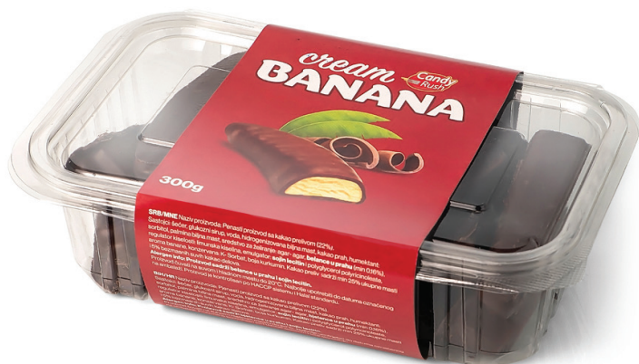
CANDY RUSH DARK BANANA 240g