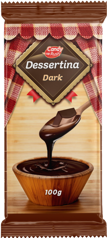
DESSERTINA DARK 100g