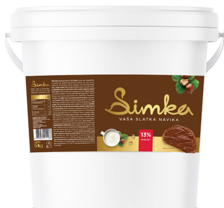
SIMKA 13% HAZELNUT 1Kg/5Kg/10Kg