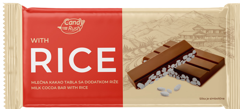
CANDY RUSH RICE 70g