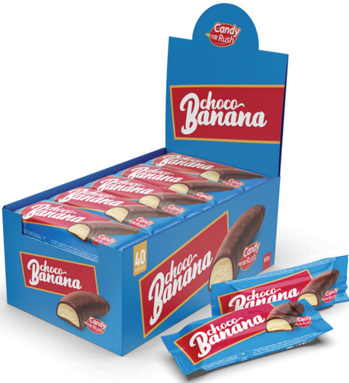
CANDY RUSH CHOKO BANANA 20g