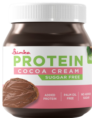
PROTEIN COCOA CREAM SUGAR FREE