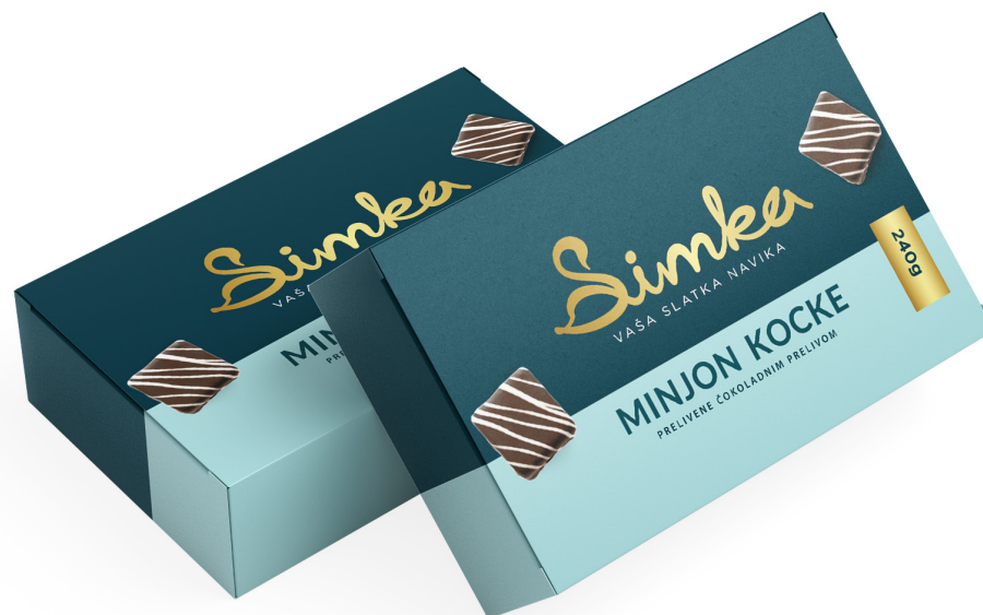
SIMKA MINJON CUBES Box 240g