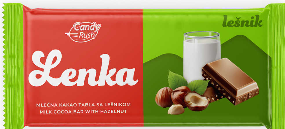
CANDY RUSH HAZELNUT MILK COCOA BAR 100g