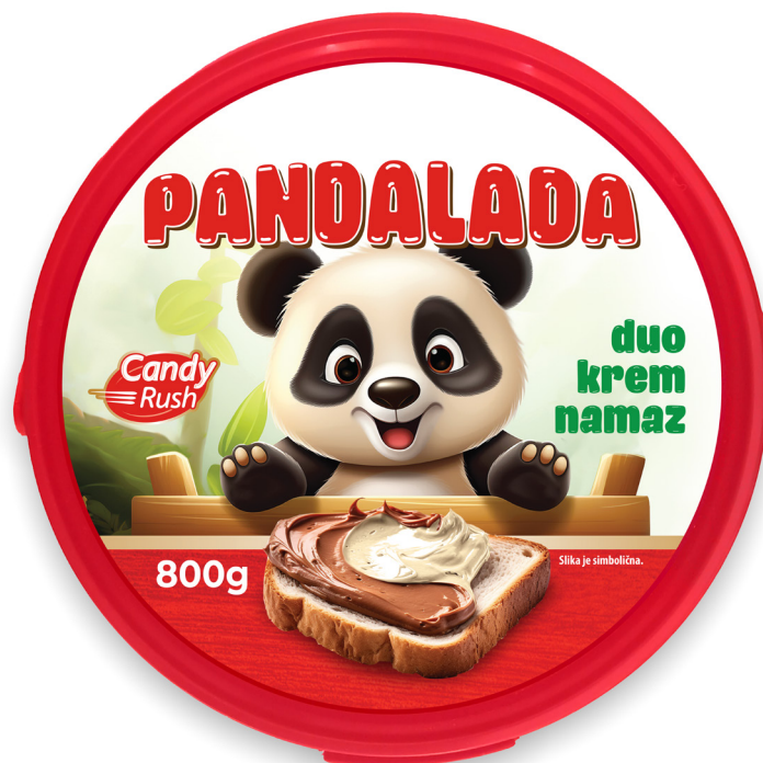
CANDY RUSH PANDALADA DUO 800g