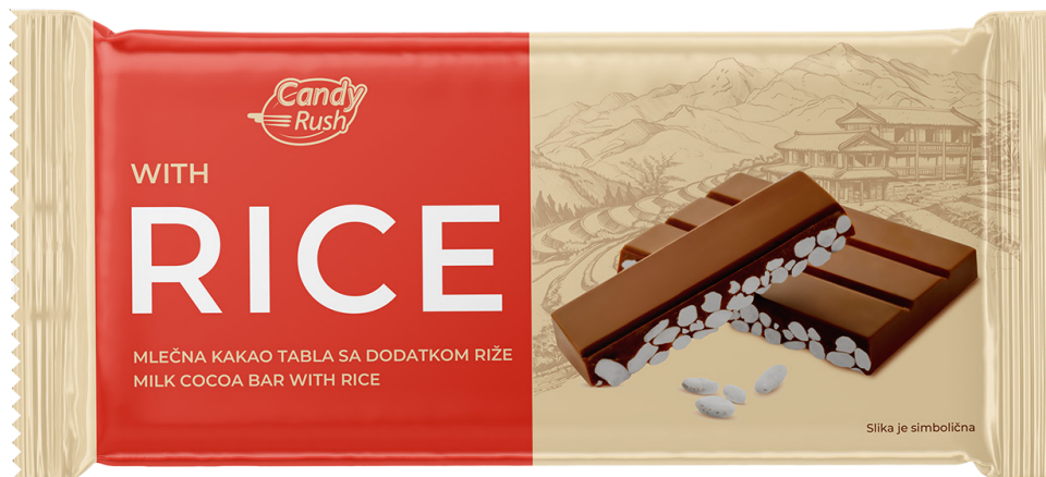
CANDY RUSH RICE 130g