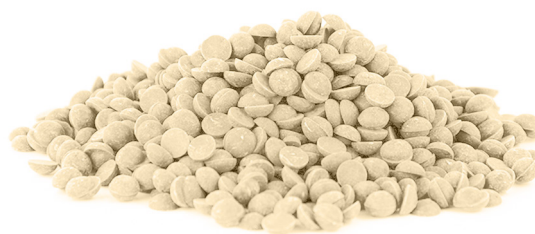
CANDY RUSH DESSERTINA WHITE DROPS 5kg