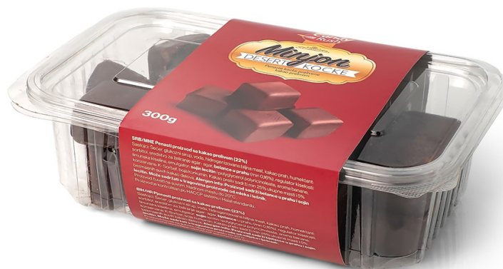
CANDY RUSH MINJON KOCKE 300g