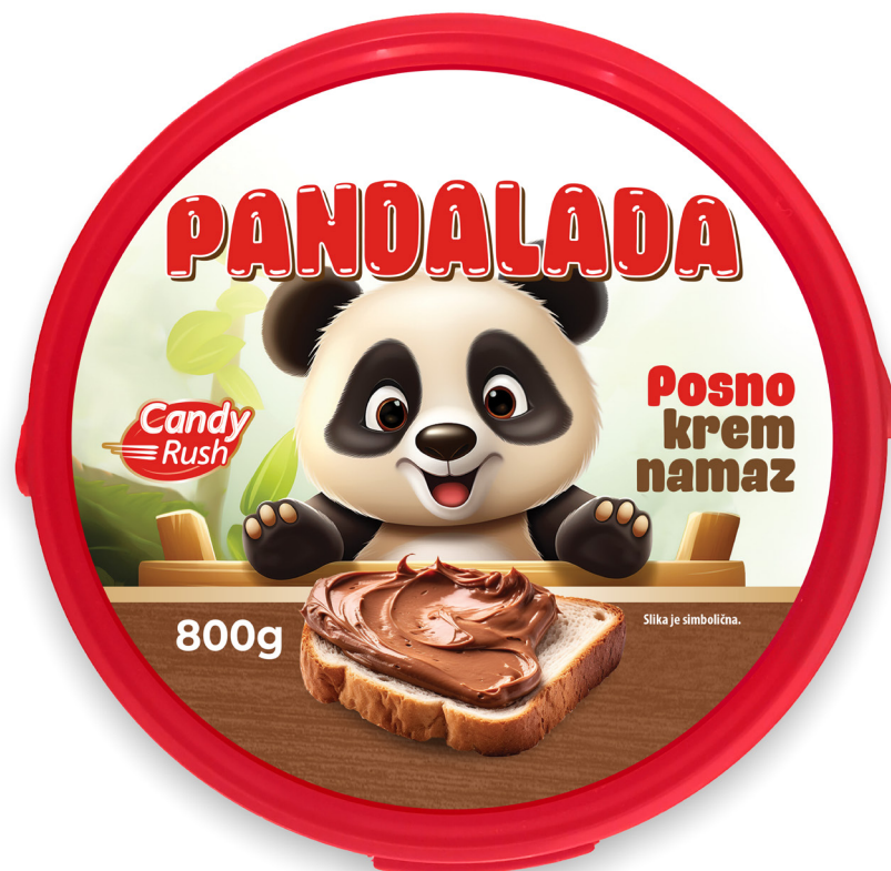
CANDY RUSH PANDALADA VEGAN 800g