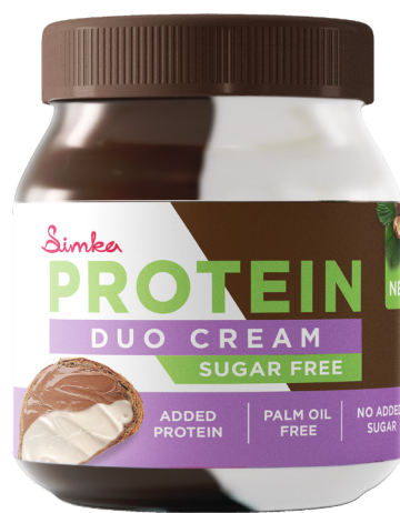
PROTEIN WHITE CREAM SUGAR FREE