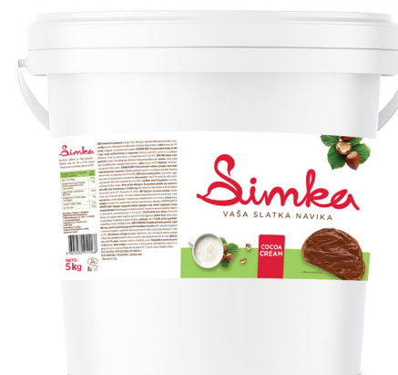
SIMKA COCOA HAZELNUT 5Kg/10Kg