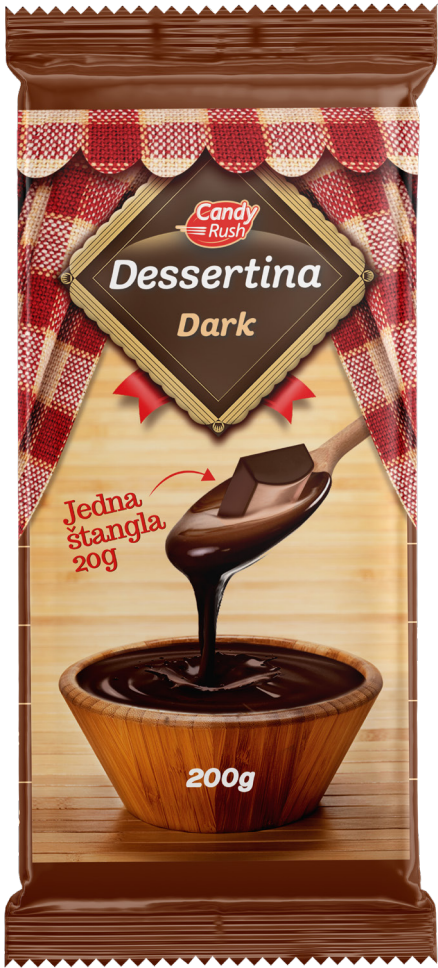
DESSERTINA DARK 200g